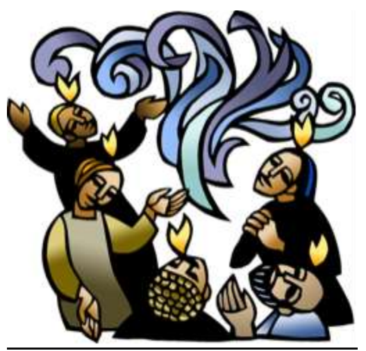
The Sounds of Pentecost! Add Your Voice!

https://www.youtube.com/channel/UCLSSna5Ti_WSwRJ_ySbMA3Q. Following the live stream, the video of worship will be posted so that you can worship as you are able any time after that.